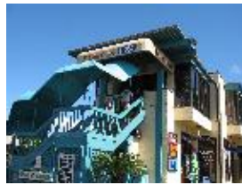
CAFE O'LEI, KIHEI

Café O'Lei (2439 S. Kihei Rd., Kihei) . Café O'Lei is another jewel with multiple locations. This is one of the better moderately priced casual restaurants on Maui and a local favorite serving up creative Pacific Rim delights of seafood, sushi, pasta, lamb and steaks. The appetizers alone can be a great meal if you share a few different appetizers with a friend. They make one called the Café O'Lei Tower, made with tempura, Ahi sushi roll, coconut shrimp and calamari rings. Popular dishes include blackened Mahi-Mahi, sesame-seared Ahi, Macadamia Nut crusted Mahi-Mahi, medallions of beef tenderloin or the braised Colorado lamb shank with roast garlic, rosemary polenta and local vegetables. The food is attractively arranged on rectangular plates. Each entrée comes with a complementary salad with basil vinaigrette dressing. The restaurant has a decent wine selection and serves good Martini's and tropical drinks. This is a great restaurant for a reasonably priced meal.