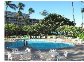
KA'ANAPALI BEACH HOTEL