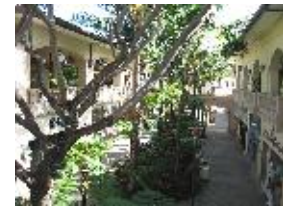
SHOPS AT WAILEA

Excellent shopping can be found at Whaler's Village at Ka'anapali Beach and The Shops at Wailea. For less touristy shopping there are various spots in Kehei, Maui Mall in Kahului and Queen Kaahumana Center in Kahului.