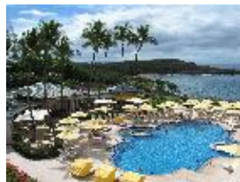
MANELE BAY, FOUR SEASONS

Day trips to the neighbor island of Lana'i are a great way to spend a day. There is daily passenger ferry service from Maui. The island is not very populated and there are just two Four Seasons resorts and one small hotel, a few restaurants, and a small 1920's-era town. You can get a real sense of old Hawaiian culture with a visit to this peaceful island. On Lana'i you can purchase an inexpensive shuttle pass that will take you between the harbor, Lana'i City, and the Four Seasons resorts. On Lana'i you can play golf at your choice of two courses, horseback ride, hike, snorkel, scuba dive, rent a jeep for the day or take a 4x4 island tour. Other than that, the island is very quiet with not much activity or amenities. Bring water and snacks. If you visit Manele Bay and the pristine beach that is shared with the Four Seasons Resort you may get the opportunity to swim with Dolphin in the wild. The waters off the beach is a popular hang out for these playful dolphin as they splash around with the snorkelers. The island is only 8-miles from Maui so the ferry ride does not take long. A good tour operator with daily excursions from Maui is Trilogy. You can enjoy a catamaran sail which includes snorkeling and lunch at the Trilogy Activity Center on Lana'i.