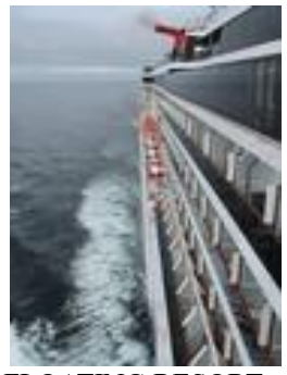
A FLOATING RESORT

"I really enjoyed my Mediterranean cruise. My husband and I celebrated our 25<sup>th</sup> wedding anniversary and had a great time. There was a large selection of shore excursion activities. Be prepared for exhaustion when this cruise is over! With only ONE day at sea, at the END of the week, there is no rest, and little time to spend enjoying the ship. This cruise is focused on sightseeing and squeezing in as many cities as you can. Most tours departed at 7:30 am, returning around 6 pm, in time for dinner (6:45 seating) and shows.