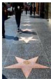
WALK OF FAME