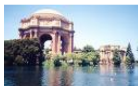
PALACE OF FINE ART